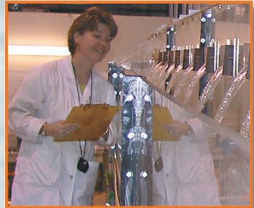
Flow distribution engineered in AWI hydraulic research facility.

AWI Phoenix Underdrain System — lowest profile available